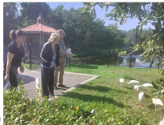
Feeding our feathery friends.

The extreme heat in Florida feels well over 100 degrees. This heat keeps us indoors most of the day. We do make an exception each morning to feed the ducks at the gazebo. After breakfast, we grab our bird food and take a short walk in the fresh air to feed our feathery friends. This walk also prepares us for our exercise class. We hope you can join us on our morning routine.