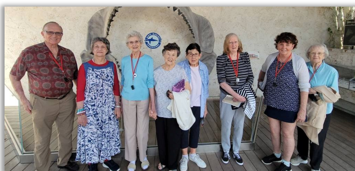
The crew with the Megalodon shark jaw.