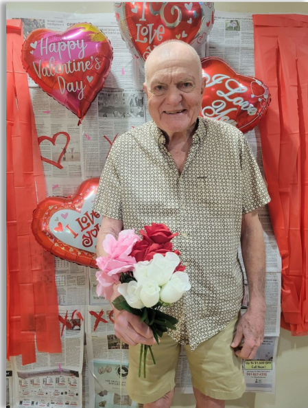
Flowers from Jim

Valentines Day is the day we celebrate Love. Not just romantic couples love but the love for our residents, staff, friends and family. We all have someone we love in our lives and what better day to celebrate this than Valentines Day.