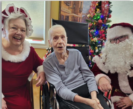
Ho! Ho! Ho!