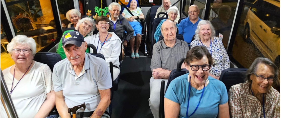
Festive folks out for a drive to see Christmas lights in and around Sarasota

3271 Proctor Road Sarasota, FL 34231 AravillaSarasota.com 941.444.9398