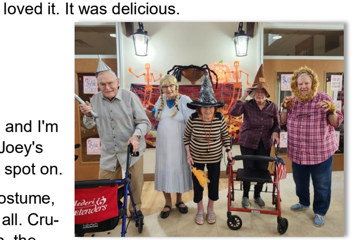
The Wizard of OZ crew.

Almost everyone donned a costume, and let me tell you, we had it all. Cruella Deville and her dalmatian, the Wizard of Oz crew, Little Red Riding